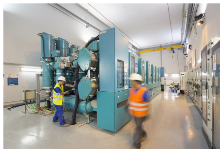
Substations and lines